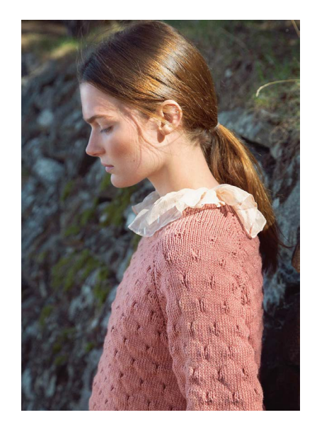
SIZES (S) M (L) XL

RAGLAN SWEATER WORKED FROM NECK DOWN / INSTRUCTION: OLAUG BEATE BJELLAND